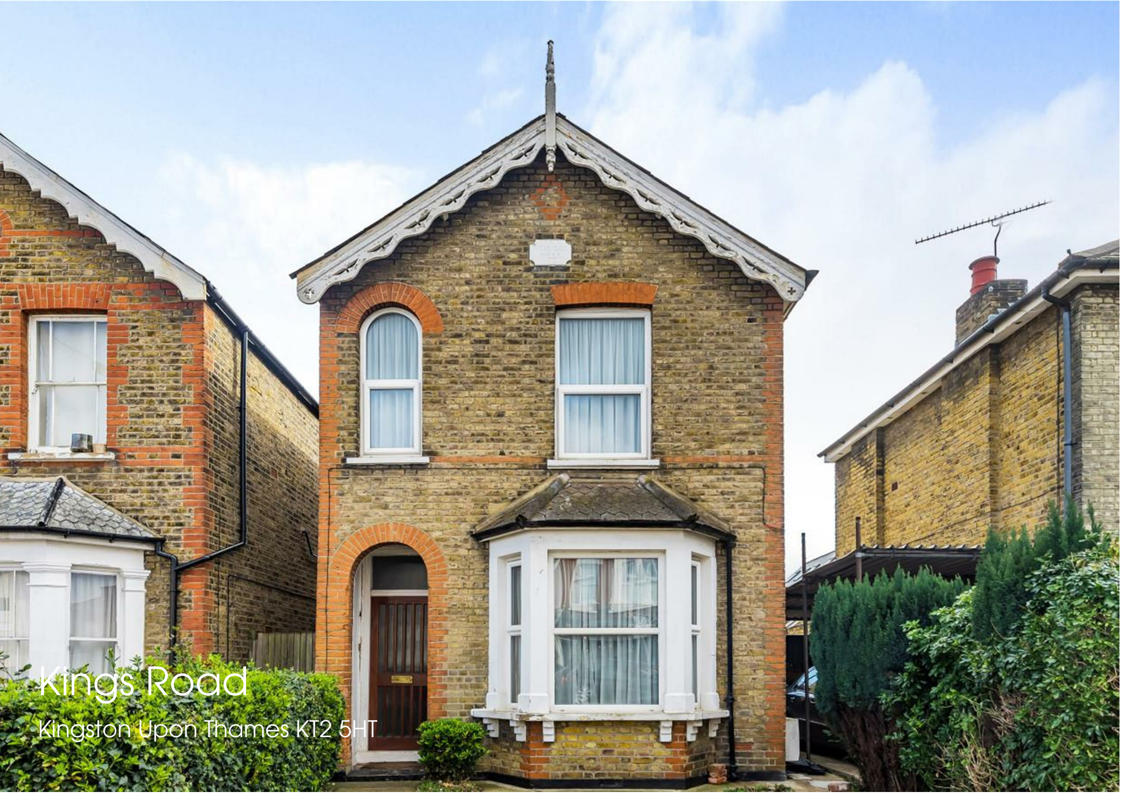
Kings Road Kingston Upon Thames KT2 5HT

34 Richmond Road Kingston upon Thames Surrey KT2 5ED www.gibsonlane.co.uk Tel: 020 8546 5444